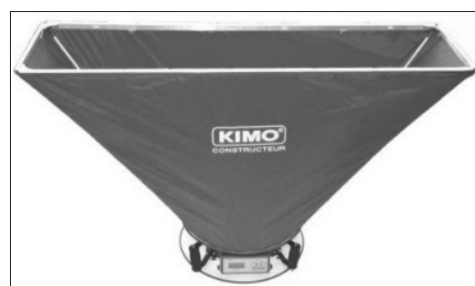
DBM Kimo with hood 1500 x 400 mm