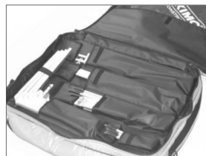
Fitted carrying case.